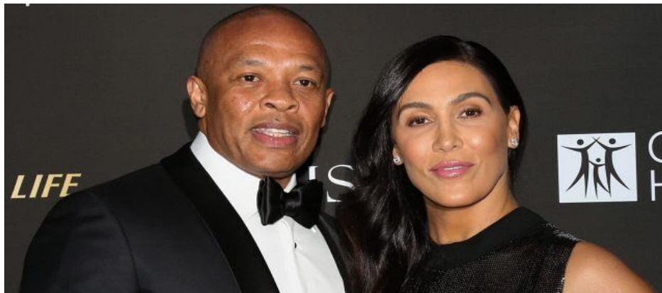
Rapper and music producer Dr. Dre, left, and his wife Nicole Young, right, attend the City Of Hope Gala on October 11, 2018, in Los Angeles, Calif.