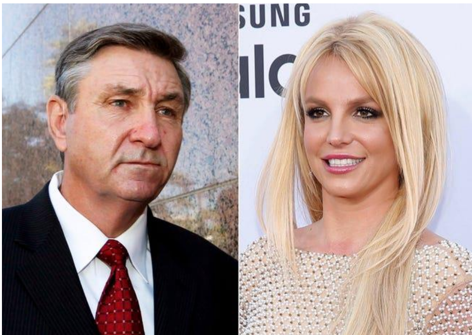
Jamie Spears and Britney Spears

The judge in Britney Spears' conservatorship case denied her new lawyer's demand to move up a crucial hearing on whether to remove her father as her conservator, as the level of acrimony among lawyers in the case rises ever higher.