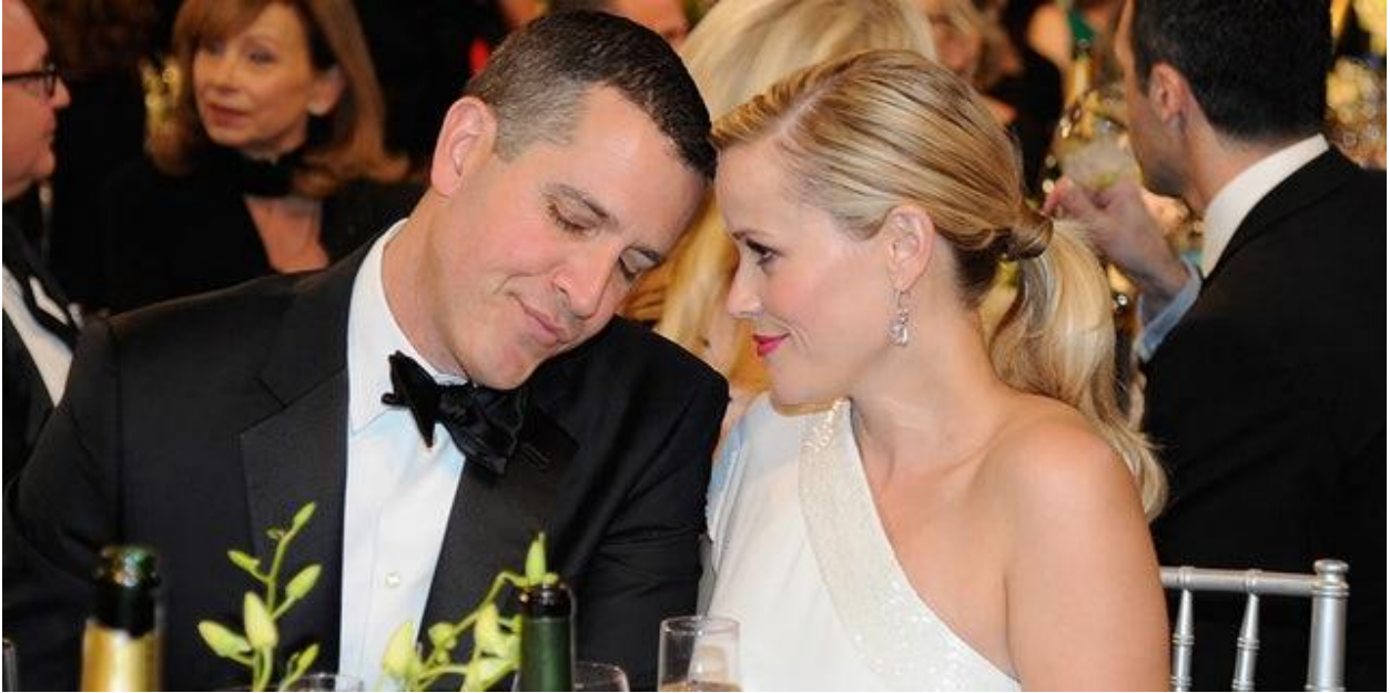
The "Sweet Home Alabama" actress wrote that their divorce was out of "mutual respect."