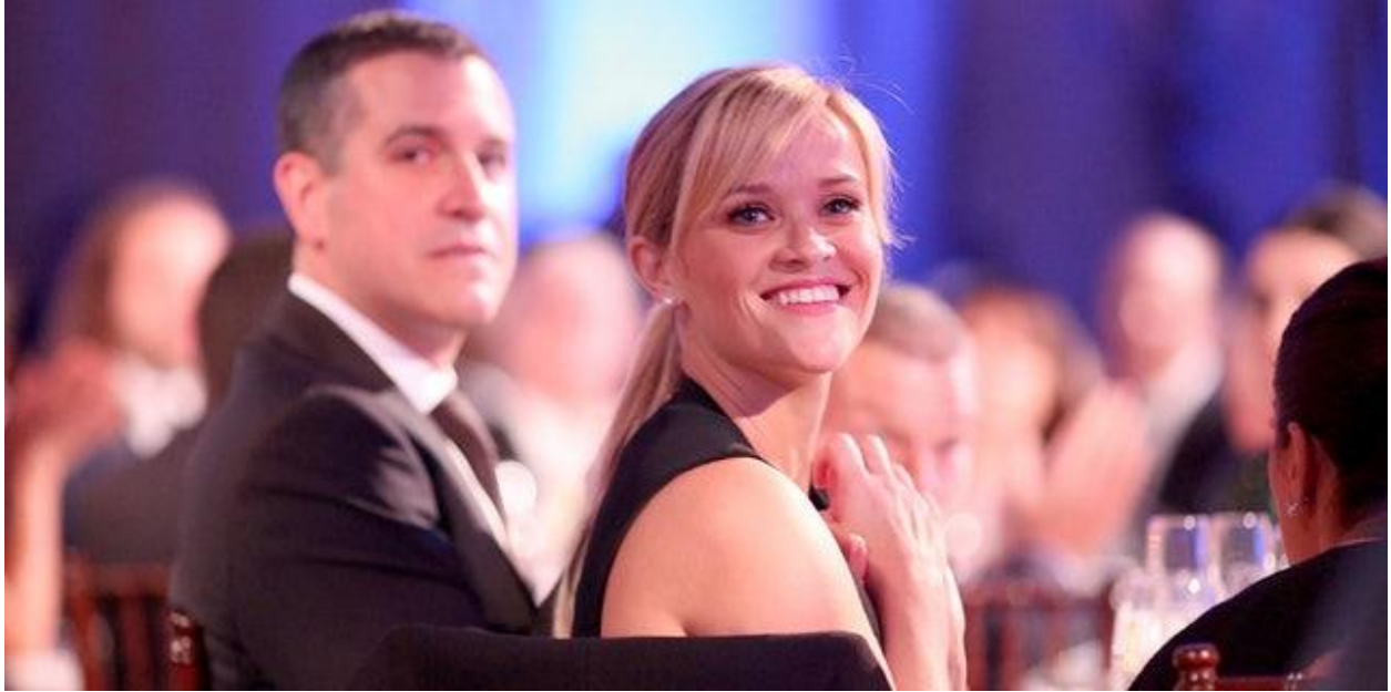
Reese Witherspoon cited "irreconcilable differences" in her divorce filing in Nashville, Tennessee.